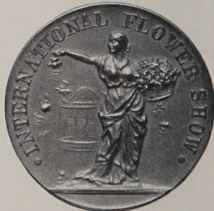
For Collection Choice Narcissi March 20-25, 1933 (200 varieties)